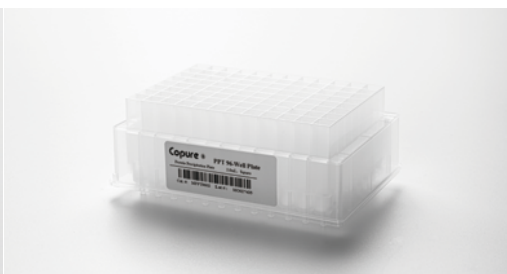
96-Well PPT (Protein Precipitation) Plate