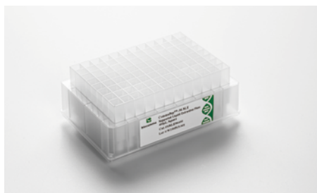
96-Well SLE (Solid Supported Liquid-Liquid Extraction) Plate